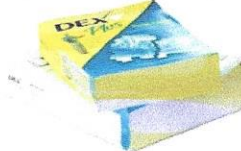
Phone Books (Directorios)