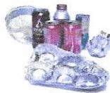
Aluminum Cans & Foil (Latas de aluminio y papel aluminio)