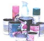
Steel and Tin Cans (Latas de hojalata y fierro)